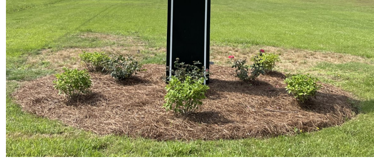
Thank you to Taten and Ashley Palmer for the beautiful landscaping around the church sign on the front lawn.

4th - 6th grade - TBA 7th - 12th grade boys - Will Addison* 7th - 12th grade girls - Ann West* *time frame to be determined